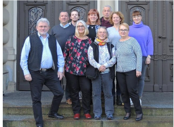
Kick-Off-Meeting at Hochschule Anhalt in Köthen / Sachsen Anhalt ERASMUS+ Projekt start: From Massive Open Online Course to Practice for Environmental-, Nature- and Climate Protection with 4 Consortium Countries. Creation Environmental Courses using Blended Learning. MOOC-2-PRAC-4-Unaklim